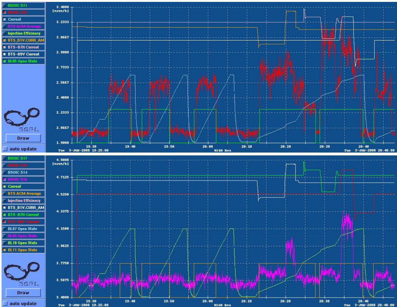
Fig.2 - Typical results from first Top-Off tests for BL 5 (top) and BL 11 (bottom). Three high-efficiency injections (left) were followed by one low-efficiency injection. The units on the vertical axis correspond to the radiation measurements of the BSOIC (red on top, pink on bottom).

Extrapolating the measured radiation to long-term operation at 100 mA, 200 mA and 500 mA trickle injection reveals that even for the worst beamline, BL 5, the total dose during 100 mA operation would lead to a dose on the order of only 190 microSv (19 mrem) in 1000 hours. At 500 mA trickle injection, however, the additional dose from component D_{ib} (the component special to Top-Off) can be up to 2.34 mSv (234 mrem) in 1000 hours. This clearly indicated a need to improve injection.